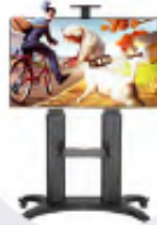
MEDIUM TV STAND 50"-70"