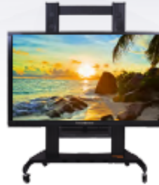
WALL MOUNT FIXED AND HEIGHT ADJUSTABLE