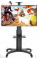
LIGHT TV STAND 40"-60"

ELEGANT AND STYLISH, DESIGNED AS A SOLUTION TO CREATE MOBILITY FOR YOUR ENTERTAINMENT NEEDS