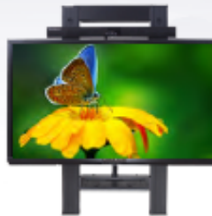
MOBILE FIXED AND HEIGHT ADJUSTABLE