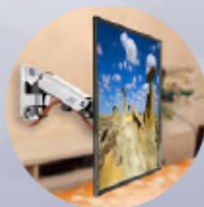
MEDIUM TV WALL MOUNT 30-40