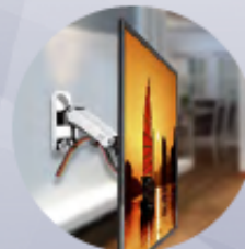
HEAVY TV WALL MOUNT 50-70