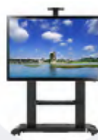
HEAVY TV STAND 60"-100"