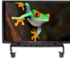
MOBILE COLUMN LIFT