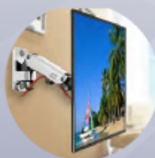
LIGHT TV WALL MOUNT 17-27