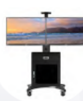
MEDIUM WORKSTATION 2 X 42"-52"