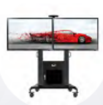
LARGE WORKSTATION 2 X 50"-60"