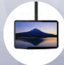
CEILING TV MOUNT 32-60